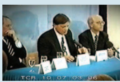
Wakefield (centre) at the press conference to launch the Lancet research

February 1998: Just days after the press conference, Wakefield and business partners meet Royal Free medical school managers to discuss a joint company to develop products based on his MMR claims, including "a replacement for attenuated viral vaccines"