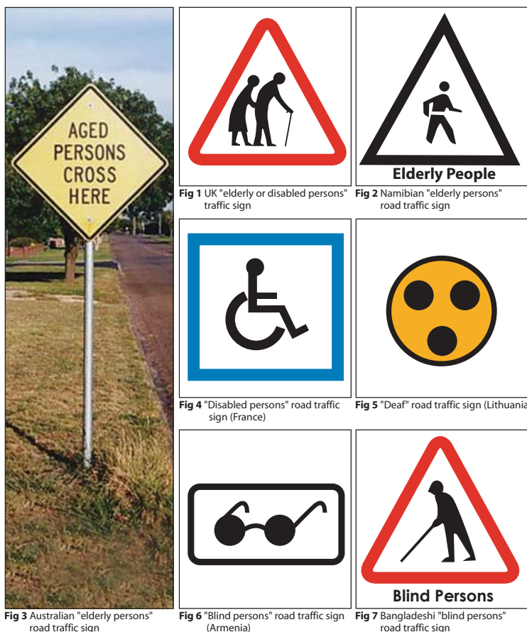
Fig 3 Australian "elderly persons" road traffic sign

People should not be stigmatised on road traffic signs, but signs must be clear and easily recognisable. Perhaps an international agreement on the content and style of such road signs is needed to meet